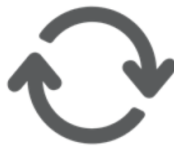
Continuous Sampling & Testing