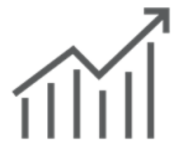
Compile Benefits and Establish an Action Plan